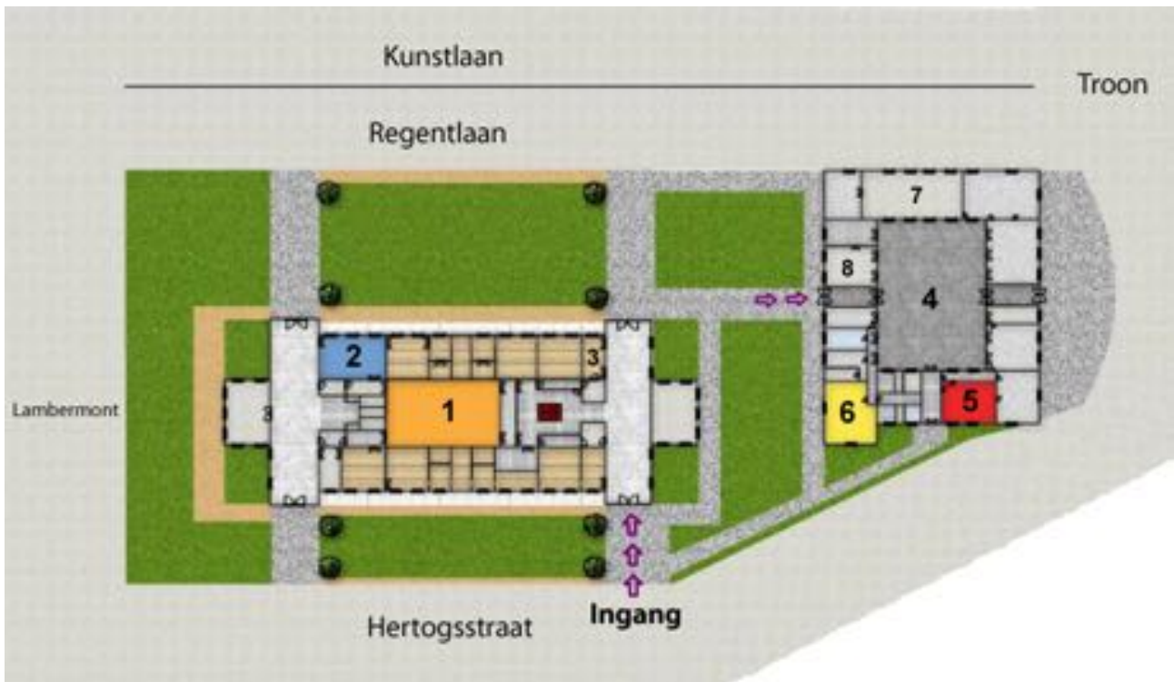
Academy Palace and “Troongebouw.” Ground floor. Rubensauditorium: 2. Ockeghemzaal: 5.

The plenary session on the morning of Wednesday March 15th takes place in the Troonzaal , which is located on the 1st floor of the main building (Academy Palace).